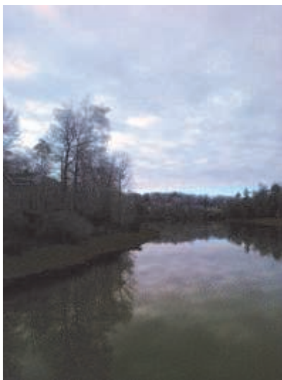
Davis Lake