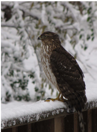
Sample Picture Only (No pictures were posted for Dec.)

Are you handy with a camera? Have a good eye for framing that perfect shot? Why don't you share them with the neighborhood?